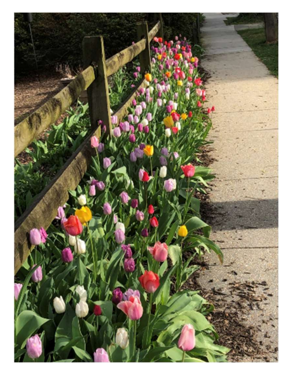
Tulips -- Leslie Cordes