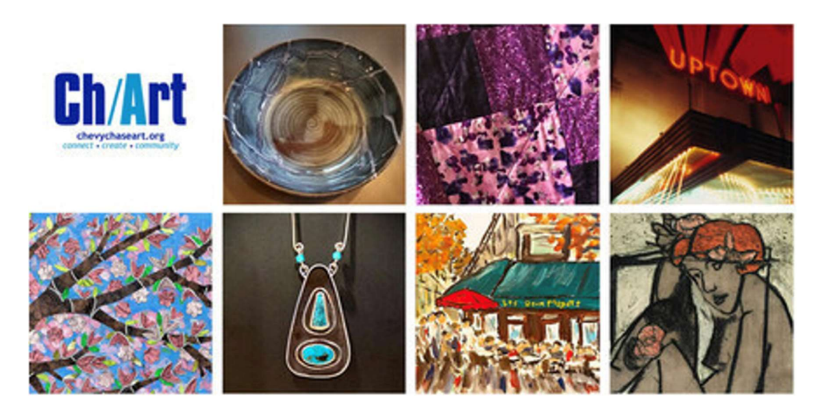
POP-UP ART SHOW April 24, 11am-5pm