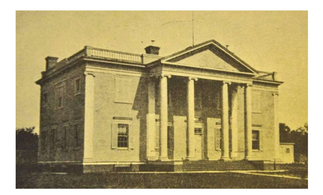
Figure 3. E. V. Brown School circa 1930

The school became overcrowded by 1909 because the Chevy Chase, D.C. land section opened for housing. In response, parents and teachers met to organize the first Home and School Association in D.C. The Chevy Chase school doubled in size to eight rooms in 1910 and the CCLC sold adjacent property to the DC government to provide outdoor space for the larger school population. The deed restrictions (including the restrictions against an apartment building and stables) were included to ensure that the City used the land only for school purposes while maintaining the value of adjacent property. Preserving the entire property was sensible because the school was expanded to sixteen rooms in 1919 and more later. The land has been serving the public for over 125 years and has always been used for "public purposes." See the fascinating account at <u>CCCA Historypic.pdf (chevychasecitizens.org)</u> for more information.